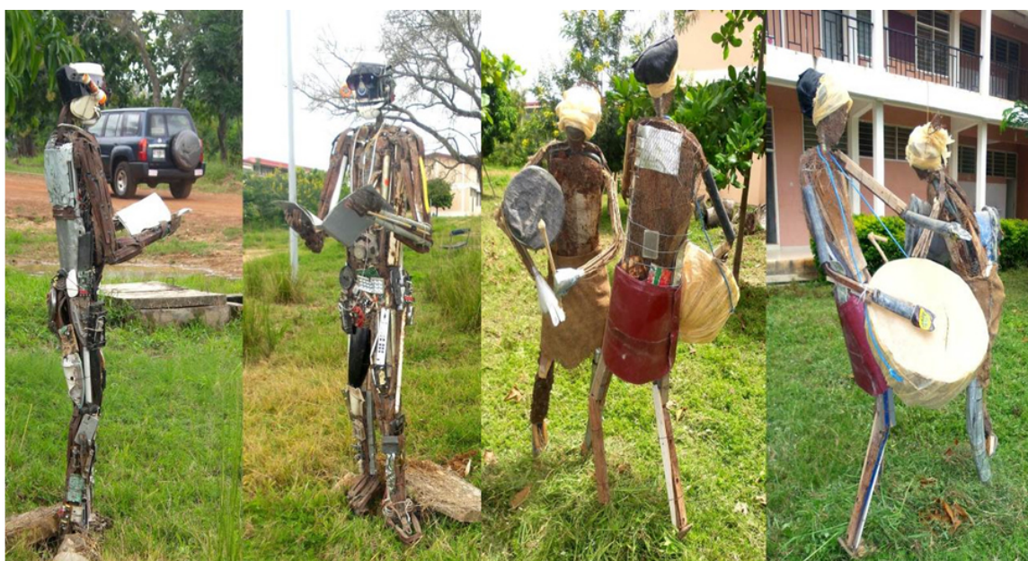
Figure 5. Mixed-media assemblages