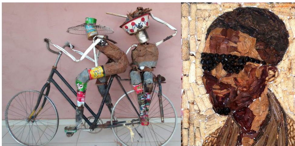
Figure 2. Found metals assemblage (left) & Found woods, seeds, corn cobs & broomsticks assemblage (right)