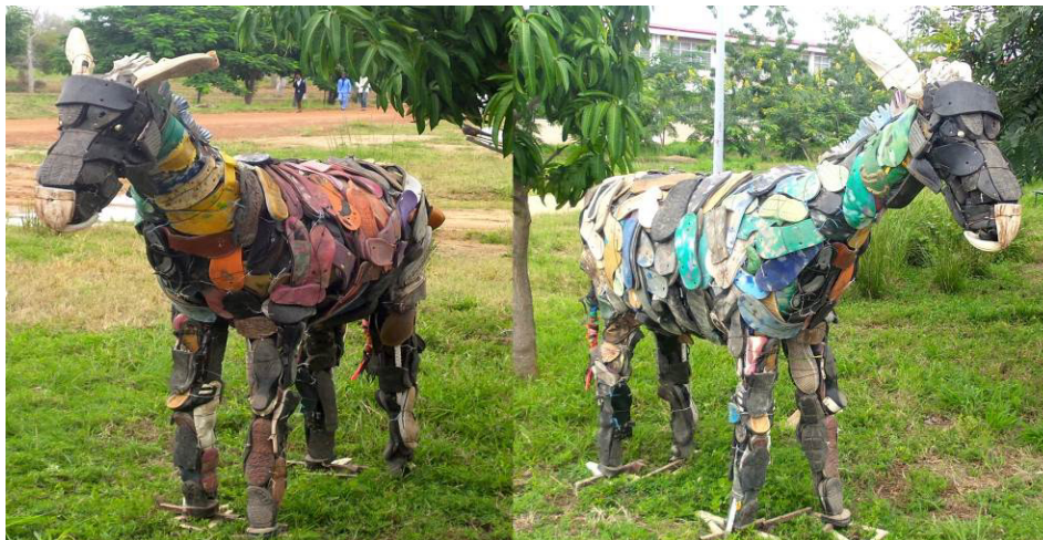
Figure 4. Assemblage produced from discarded foot wears