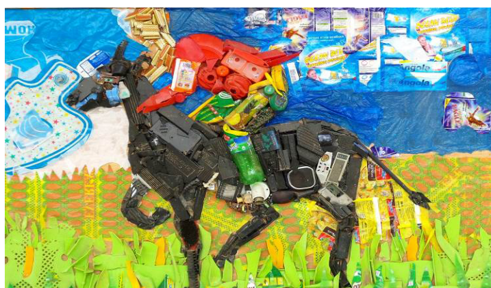
Figure 3. Plastics, rubbers and polythene assemblage