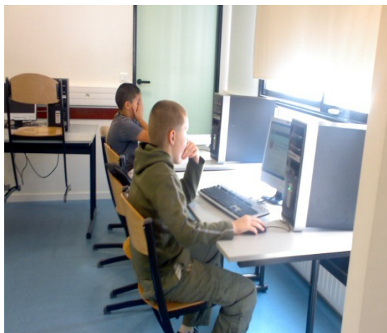
Figure 1: Staging learners in a multimedia room

of the problems of expression, communication and ergonomics.