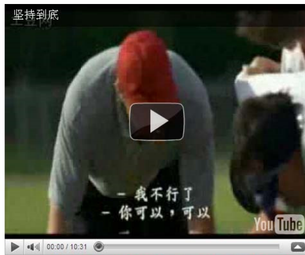
Figure 3: Print screen of the video clip (Group B).