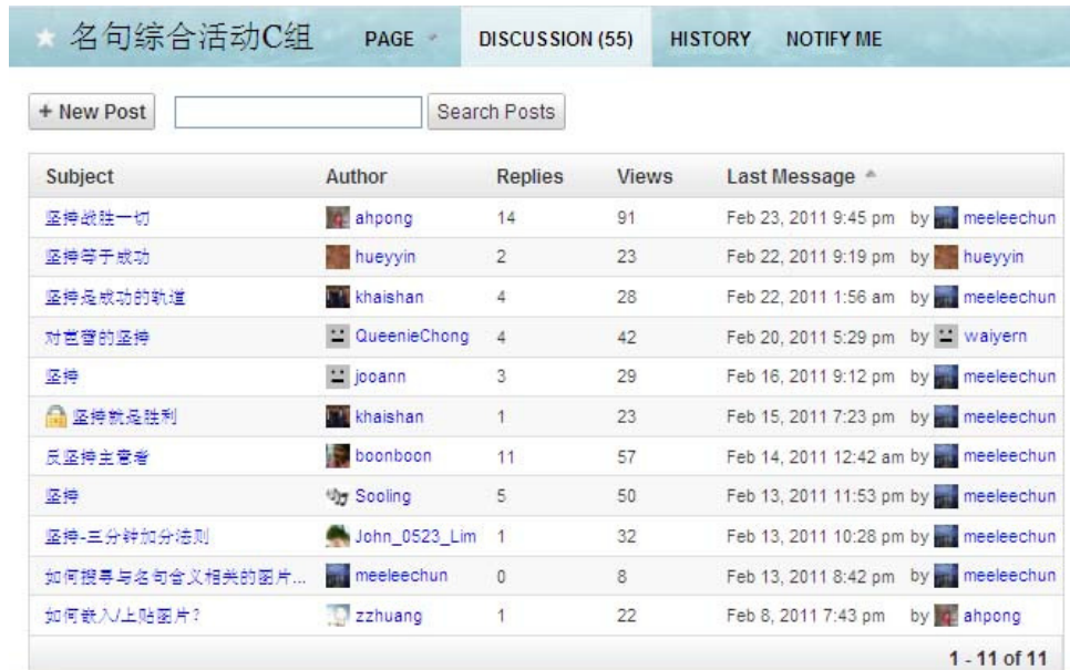
Figure 1: Print screen of discussion posts.