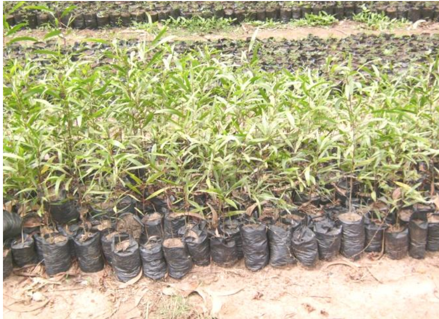
Figure 2. Three months Acacia auriculiformis Seedlings in a village nursery.

bags (figure 2) which constitute an adaptation made by nursery holders. The bags were filled in manually with compost. The pre-treated seeds were sown (2-3 seeds per bag) at a maximum depth of one centimeter. After germination of the seedlings, a form of shading was placed during the first two weeks to protect the young seedlings from direct sunlight.