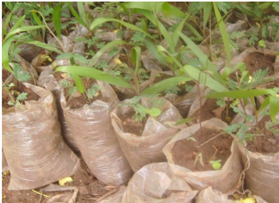
Figure 3. One month Acacia auriculiformis seedlings in a village nursery.