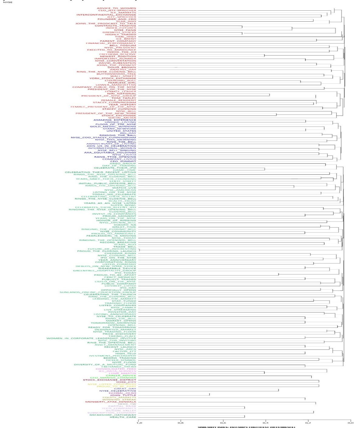
Figure 2. Dendrogram @NYSE

The oil topic also discussed @NYSE, including information about the Liberty Oil Field Service, which is officially open and also the tweet posted on 12 January 2018. Liberty Oil Field Service is the leading hydrologic partner services company. They use analytical data for the activities.