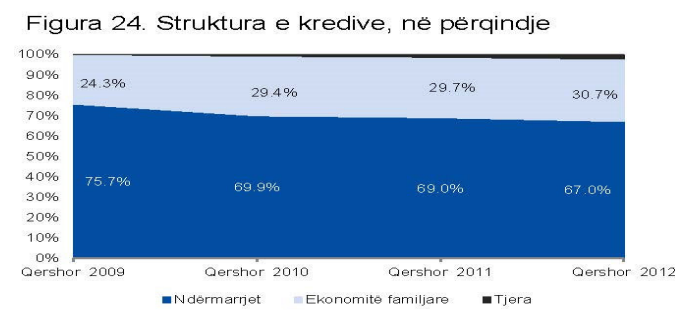
Burimi: BQK (2012)

The ranking on Investor protection reflect well-functioning courts and up-to-date procedural rules that give minority investors the means to prove their case and obtain a judgment within a reasonable time.