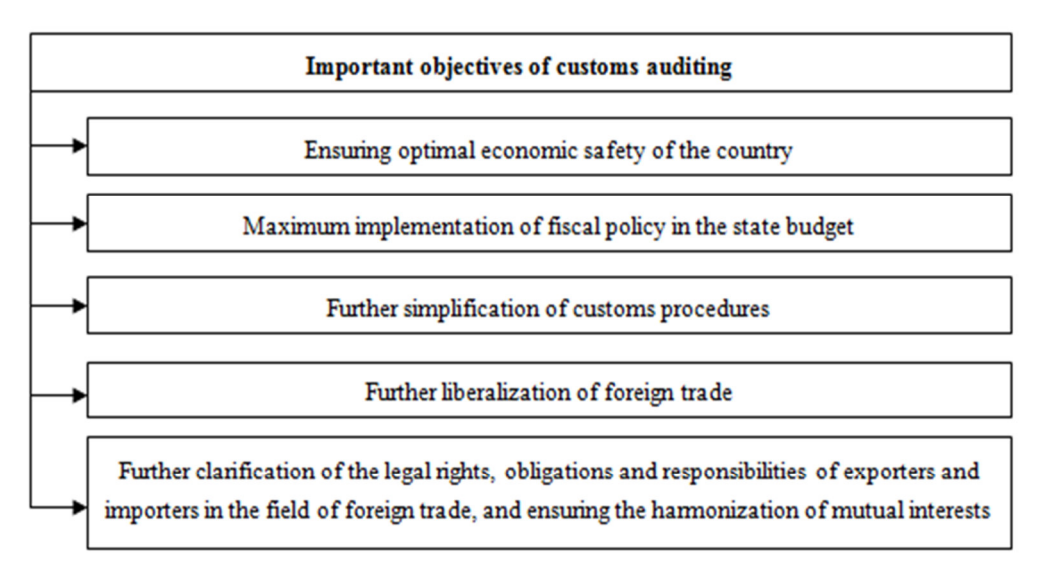
Figure 1. Important tasks which should always be ensured in customs clearance of commodities based on the experience of the developed foreign countries

On the basis of the targeted development of the customs audit, in our opinion, special attention should be paid to the following areas of customs audit (Figure 2)