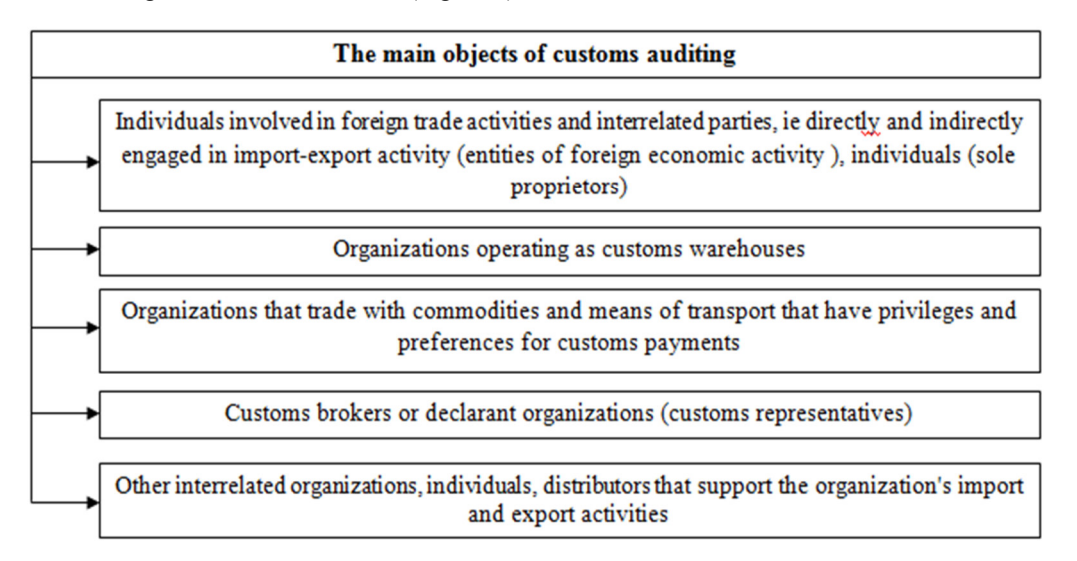
Figure 2. The main objects of customs auditing

On the basis of the targeted development of the customs audit, in our opinion, special attention should be paid to the following areas of customs audit (Figure 2)