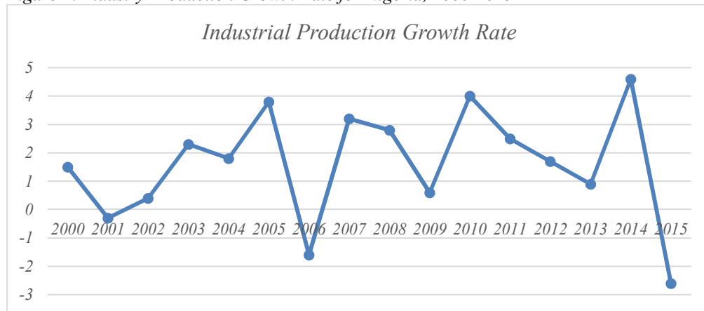
Figure 1: Industry Production Growth Rate for Nigeria, 2000-2015

As shown in Figure 1, the growth rate of the Nigeria industrial sector over the years has witnessed a series of ups and down. In 2001-2003, industrial growth rate witnesses a steady rise, but this was ephemeral, as it declined again in 2004, a steady decline was observed from 2010-2013. In 2015 the growth rate plummeted to an all-time low of -2.60. Despite several policies enacted by the government to ensure an extensive growth in the sector, why has the Nigerian Industrial sector growth rate remain very unstable over the years?