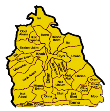
Fig 2 Map of Akwa Ibom state showing LGAs