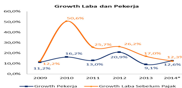
Figure 2. Growth Earning Per Number of Workers in PT. BANK KIT (Persero) Tbk. Year 2007 – 2014

Compared to five years earlier, in 2014, number of worker's growth has not been matched by growth in corporate earnings is shown with more downs earnings per worker compared to the growth in the number of workers in 2014. Growth earnings show a decline from year to year, but the growth in the number of workers on an upward trend ( Picture 2).