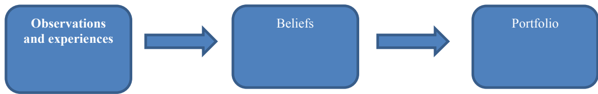
Figure 2.1: The Fundamentals of the Portfolio Selection Process

It is both evident and intentional from the very introduction of the concept of asset allocation that the beliefs we hold are at the core of the portfolio selection process. In this sense it is important to understand that the process represents not only a diversification of assets or asset classes, but also a diversification of the beliefs regarding the expected returns and risks of those investments or asset classes. (Cochrane, 2007).