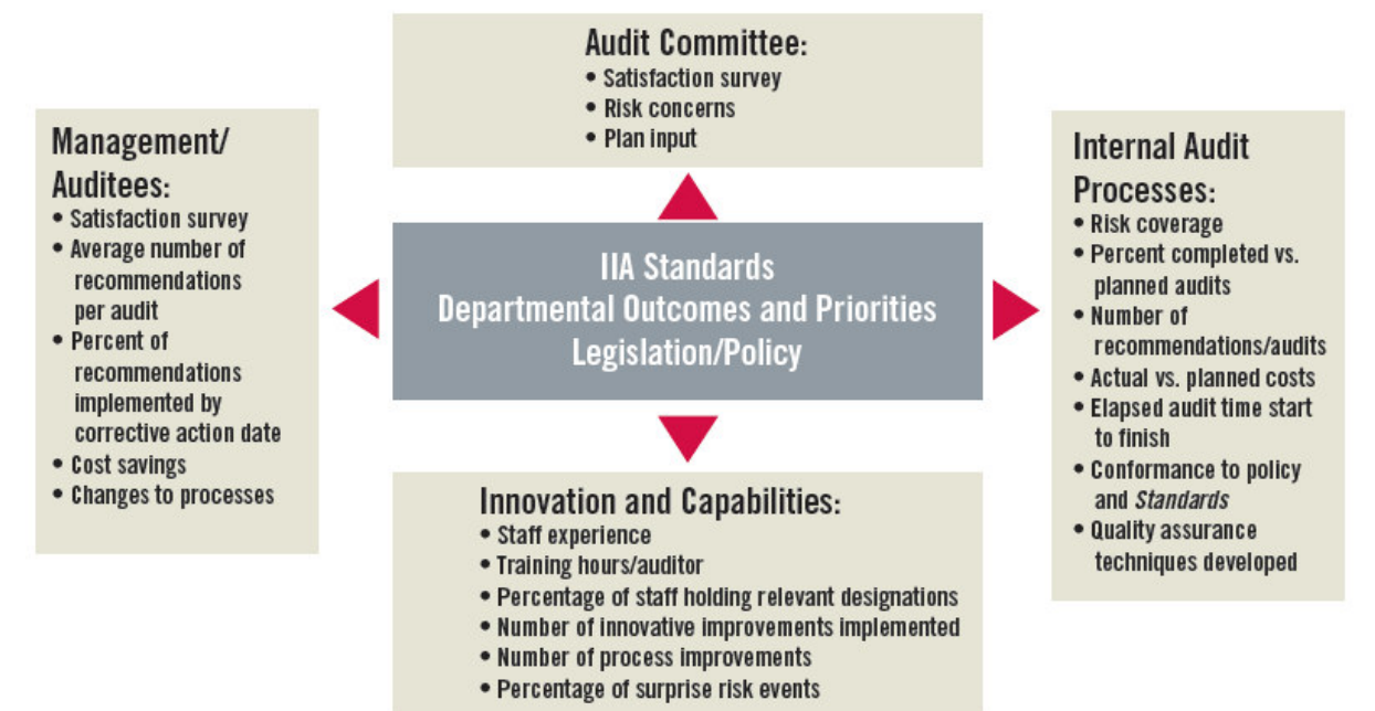
Figure: 3 Internal Audit Balanced Scorecard Performance Measures