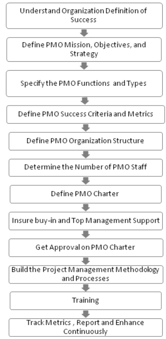
Figure 2: Proposed PMO framework

statement is "The PMO will enable the organization to deliver projects on budget, on time, and with higher quality, leading to more organizational efficiency and higher customer satisfaction." PMO strategy defines, at a high level, the process and roadmap to achieve the PMO mission. The strategy also focuses on how to achieve the long-term objectives of the PMO, how to make organization project-management practices more successful, the reason for establishing a PMO, the functions it should provide to the organization, and the types of services or gaps the PMO should fill. The PMO mission and strategy must align with and support the organization's mission and strategy. It is incorrect, for instance, for a company to set up its PMO success criteria around budget when the organization's overall focus is