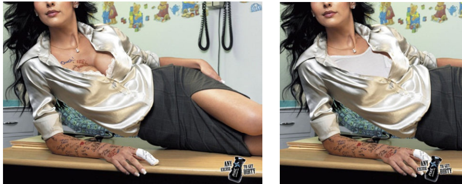
Figure 2: Research Stimuli. Ads print stimuli were manipulated into two category: partially clad and demure (Reichert et al, 2011)

often show the sexual appeals in its advertising. We manipulated the ads print stimuli into two category: partially clad and demure (Reichert et al, 2011). We could not use strong overt ads stimuli since it was prohibited by Indonesia's law.