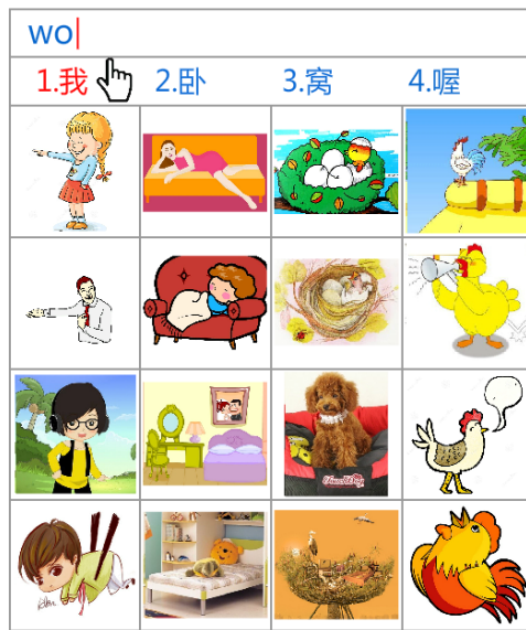
Figure 4. After a three second delay students are supported via several images corresponding to the meaning of the word or idea embodied in the character.

and then for images that most likely represent strength. In this way the image columns do not need to be so precise as to allow the learner to guess the meanings of all the characters but rather offer enough to select images that match the character they need (卅). Flickr allows for images to be returned based on relevance and a “safe” and “moderate” rating signifying they are appropriate for all and most audiences respectively, we use combinations of these designations in our searches.