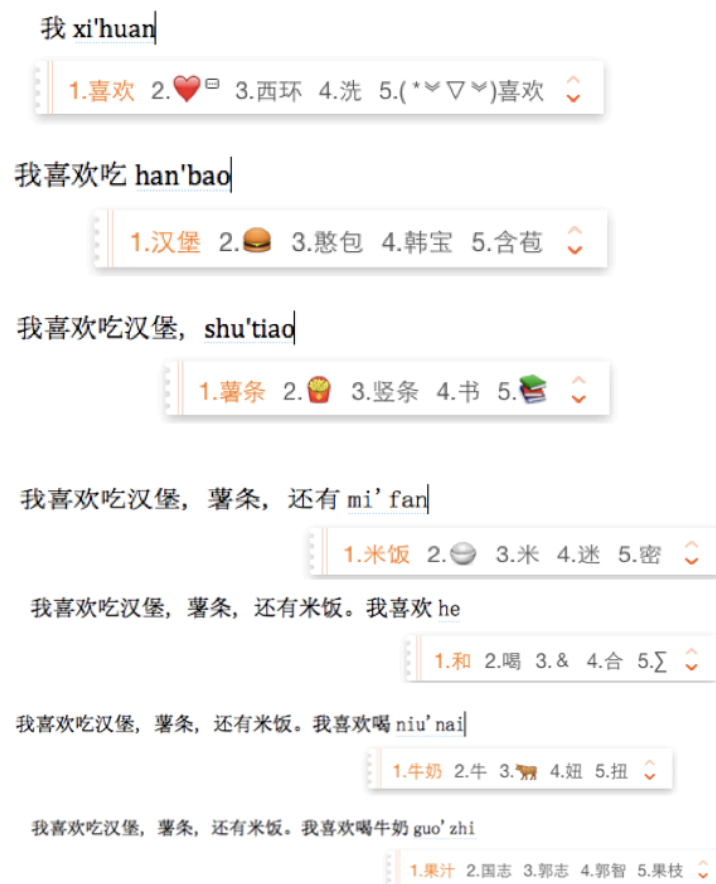
Figure 1. The Sougou pinyin input method uses emojis in place of their corresponding characters.

first illustrated language textbook being a Latin text dating to the middle of the seventeenth century (Comenius, 1999). This history exists in part due to the impact of multimodal learning. Words and language represent experiences that are, for most people, formed upon layers of simultaneous multi-sensory input. Visual, aural, haptic, and sometimes olfactory and gustatory experiences are a part of navigating the world and thus, also a part of learning to navigate new cultures and languages. Innovations such as writing, drawing, photography, and print media have offered powerful gateways through which to acquire language and learn cultural nuances (Jewitt, 2005). With the ubiquity of networked devices and new media, the opportunities to use text, sound, and images in concert with one another to support learning and productivity has become increasingly commonplace (Kalantzis & Cope, 2012).