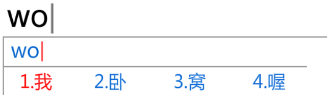
Figure 2. The process of producing Chinese characters within digital mediums uses pinyin and visual identification of intended characters.

In the application, students begin by typing the pinyin version of the word or concept they wish to express. Just like the input method used by native speakers, Chinese Character Helper returns a series of options based on how many characters use the same pinyin. For example typing “ma” into the input field returns at least five characters, one each for mā: 妈 (mother), má: 麻 (to bother), mǎ: 马 (horse), mà: 骂 (to scold), and ma: 吗 (an interrogative particle). As shown in Figure 2 below, “wo” written in the application returns multiple words, many with different tones but some with the same tone—as some words in Chinese are homophones, sharing identical pronunciation but with different meanings and characters.