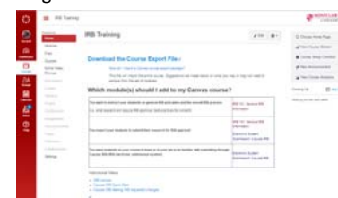
Figure 4. CANVAS learning modules

Special Thanks to the Montclair State University Division of Academic Affairs and the Associate Provost for continued support of these activities