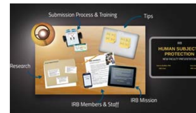
Prezi Presentation to New Faculty