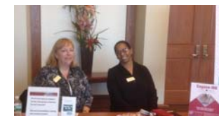
IRB Staff at the Student Research Symposium