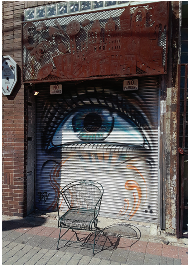
Third Eye Molly Brown