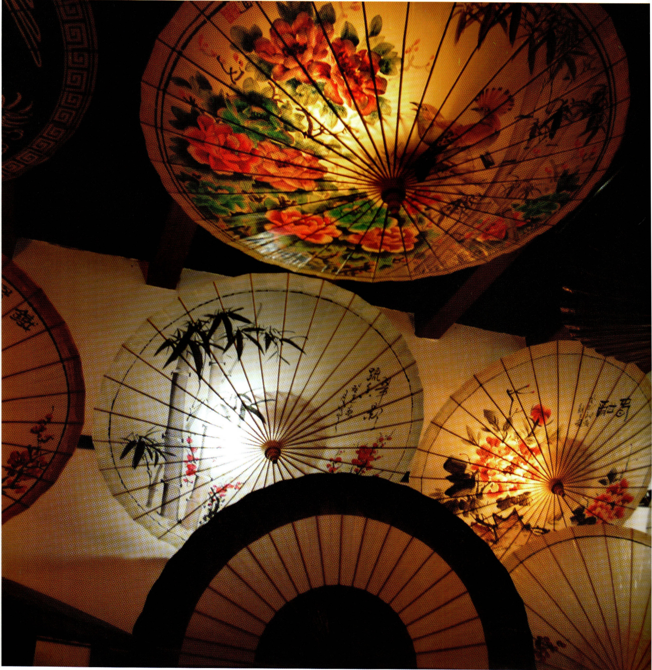
MOONLIGHT Clair (Qu) Wu