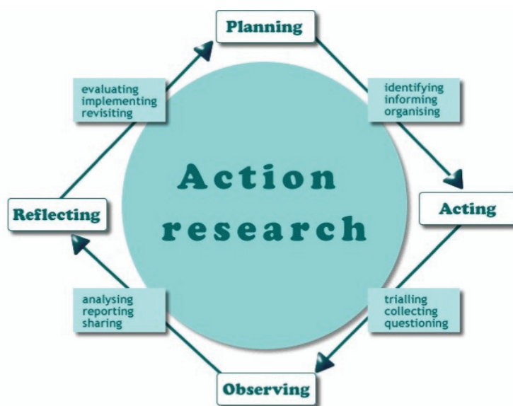
Figure 1. An action research cycle

A longitudinal study of the impact on a wider range of stakeholders (and in particular the long-term influence on student achievement data) may be implied, but that was beyond the scope of this introductory work. Rather, this study focuses solely on the impressions of the ILP participants with regard to the perceived professional impact on their practice in the schools that they led at the time of the study.