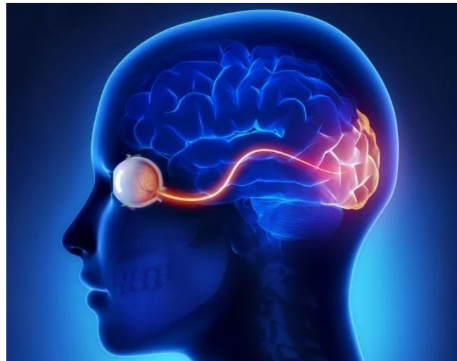
Figure 6: Human’s Eyes and Brain

One of the frequent disparagements that eye tracking research often receives is the query on whether the ‘eyes’ have enough features to represent the processes in the brain. In response to this criticism, Rayner et al. (2012) and Lin and Tsai (2015) explains that in the brain, the optic nerve transmits vision signals to the lateral geniculate nucleus (LGN), where visual information is relayed to the visual cortex of the brain that converts the image impulses into objects that we see. Hence, the ability of a human to see is due to his or her capacity for visual perception in defining the surrounding environment.