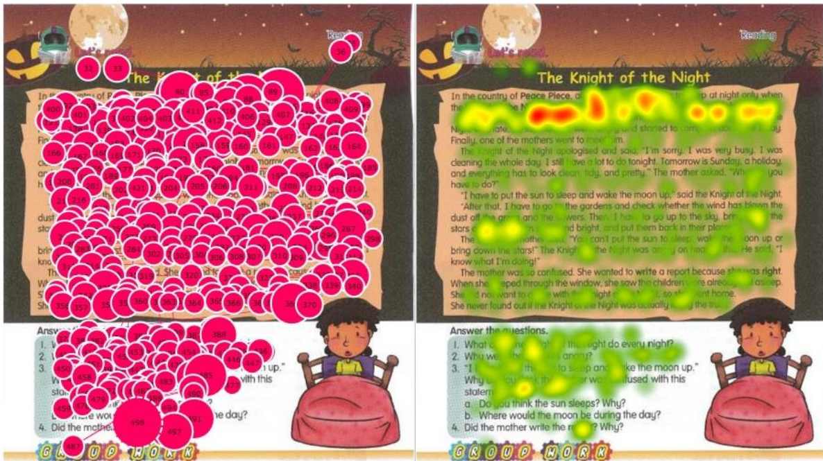
Figure 4: Gaze-plot (Left) and Attention Heat-map (Right)

Attention heat-maps help to provide quick information on any patterns or trends that may exist on the data. Based on Figure 3, data on the heat-map are normally represented in three colours: 1. green, 2. yellow and 3. red. The Red colour on the heat-map reflects a good amount of fixation on the stimulus (Bojko, 2009). This means, the more a reader fixates on a certain part of a stimulus, the colour will gradually change from green to yellow, and from yellow to red. According to Bojko (2009) there are different types of heat-maps: 1. Fixation count heat-map (FCH), 2. Absolute gaze duration heat-map (AGDH), 3. Relative gaze duration heat-map (RGDH) and 4. Participant percentage heat-map (PPH). Despite their different purposes, researchers have to be aware that each attention heat-map can be a representation of a reader (individual) or as a group (collective). For example, if the researcher decides to use a heat-map to guide the lab interview process (also called exit-interview), the researcher might want to use the individual heat-map because it represents the cognitive processes of the interviewee. The collective attention heat-map, on the other hand, represents the summary heat-map of the research samples.