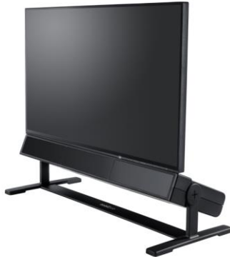
Figure 1: An Eye-Tracking Apparatus