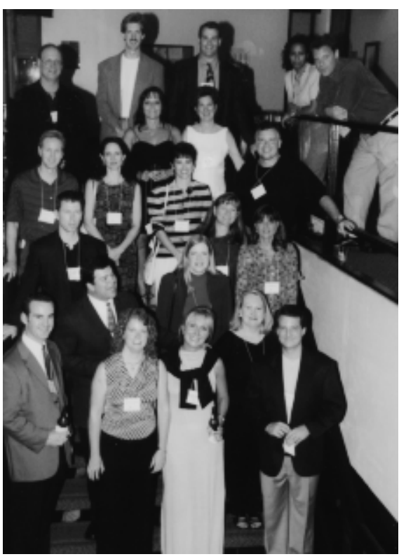
Class of 1991