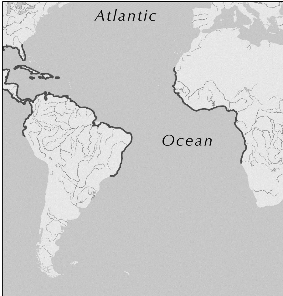
Figure 02. Mangrove Coverage of Brazil and Western Africa

mangroves but also the associated shellfishery, in turn depriving local populations of a crucial source of dietary protein (Corcoran et al. 2007; Carney et al. 2014).