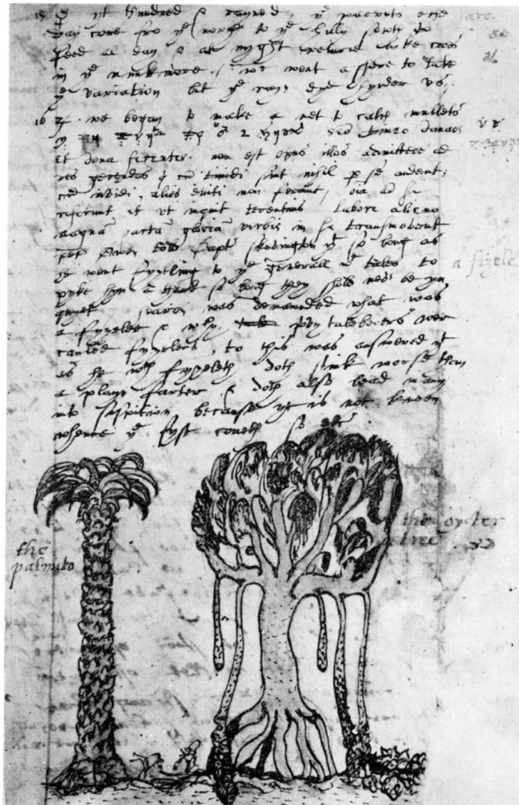
Fig. 10. Madox's sketch of the palmito and the oyster tree