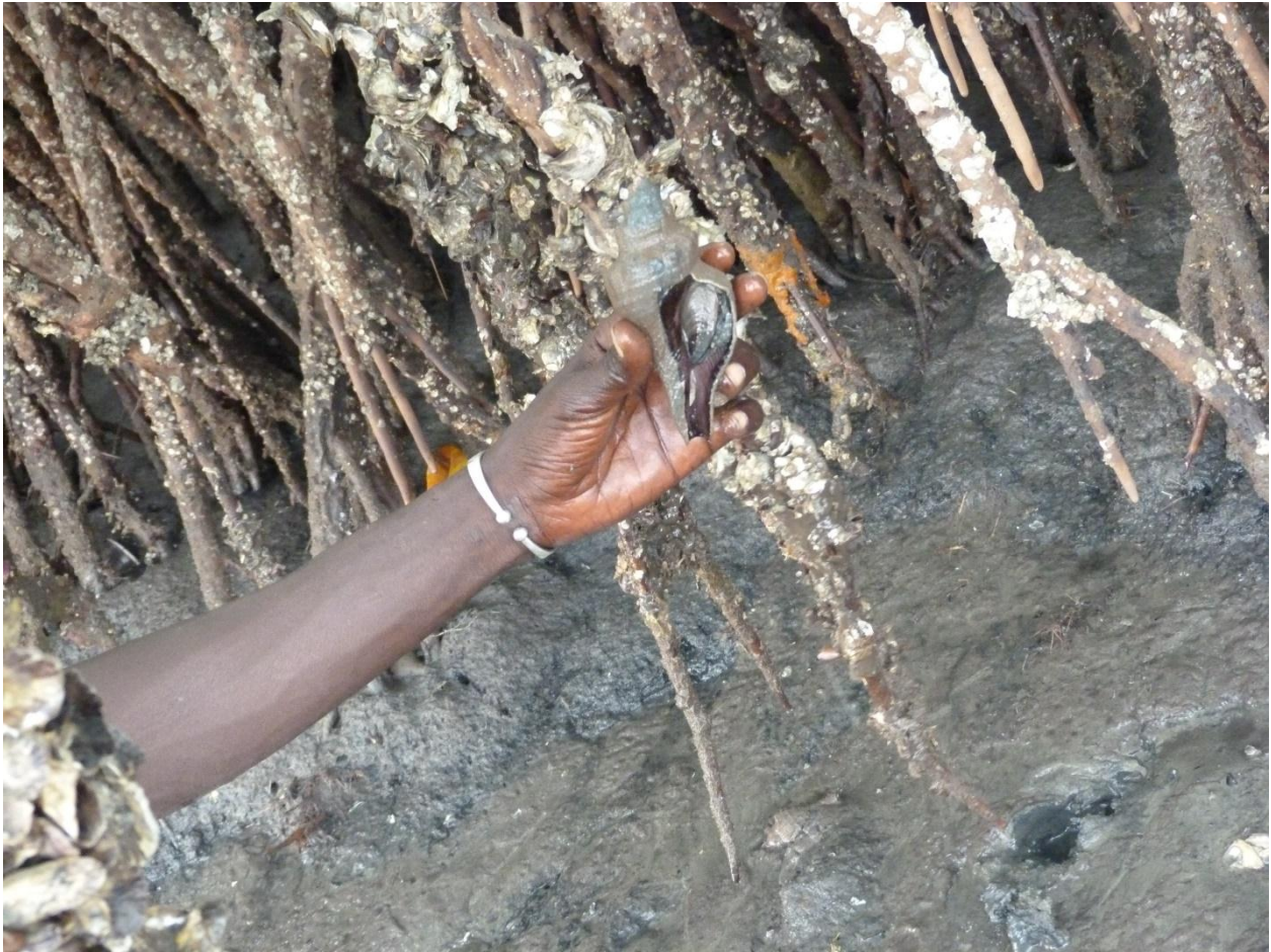
Figure 06. Pugila morio in mangrove oyster mudflats, The Gambia

Photo credit: Richard Rosomoff, November 2015.