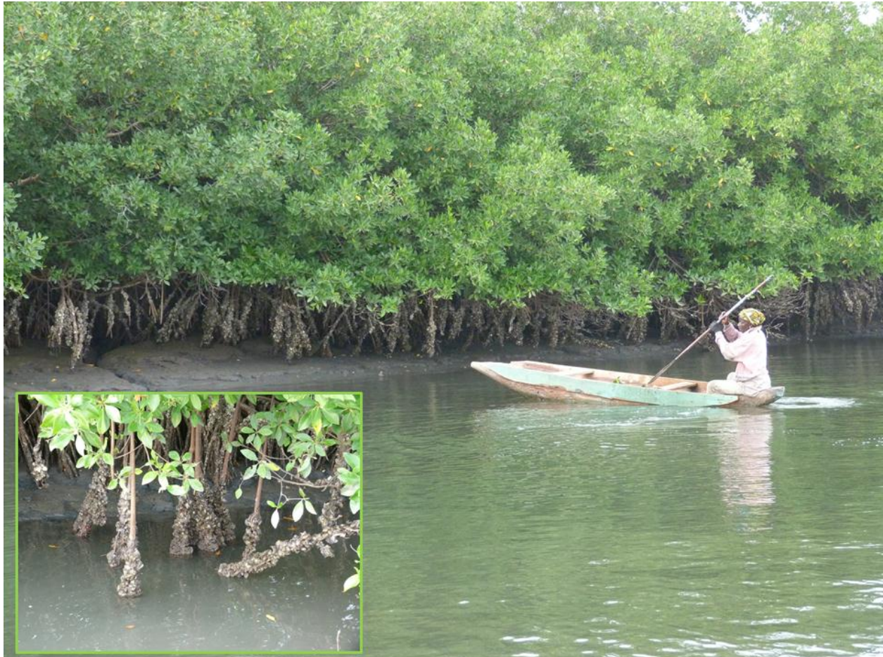
Figure 04. C. gasar oysters growing on Rhizophora mangroves in The Gambia

November 2015.