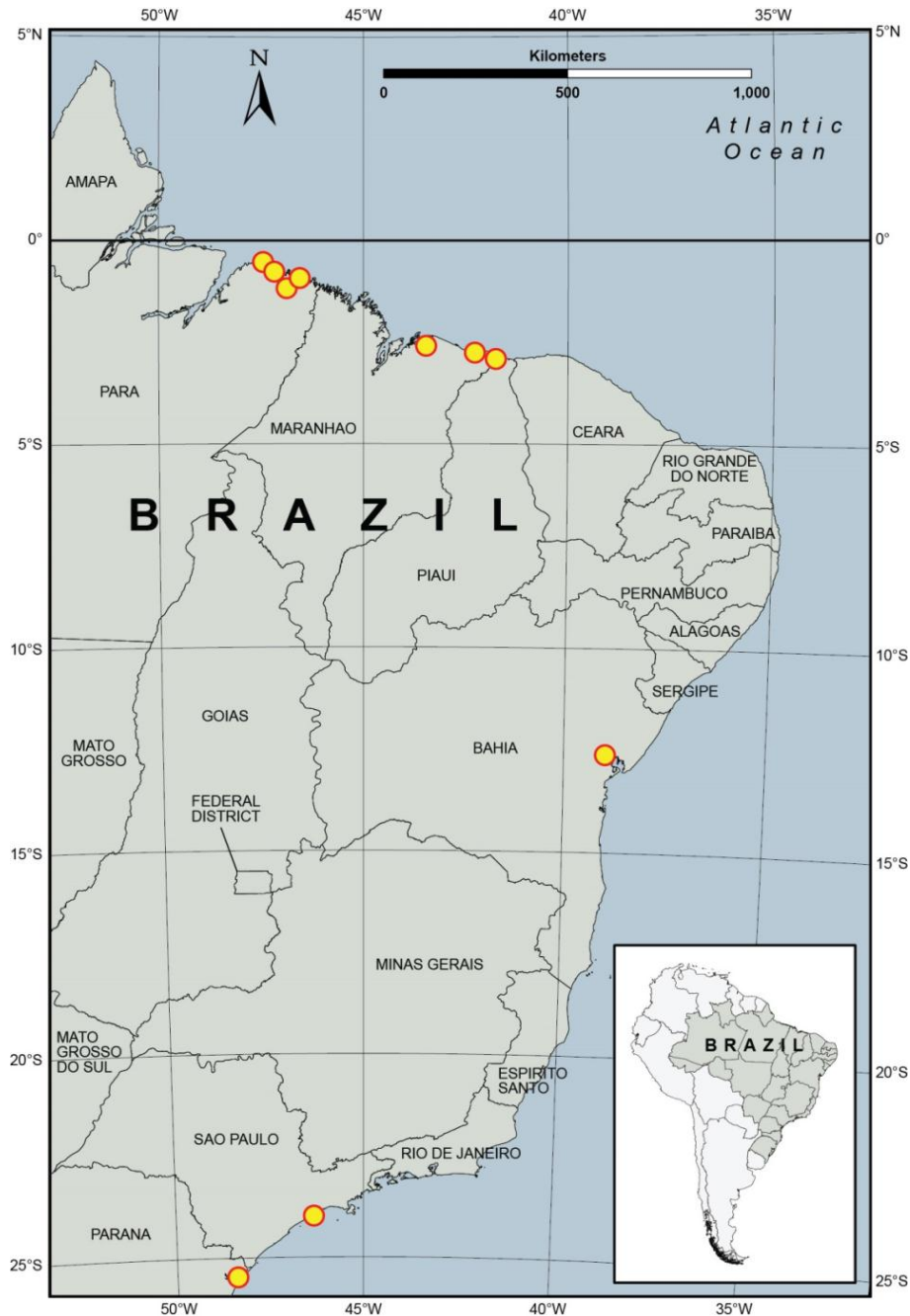
Figure 05. Distribution of the African mangrove oyster ( Crassostrea gasar ) in Brazil