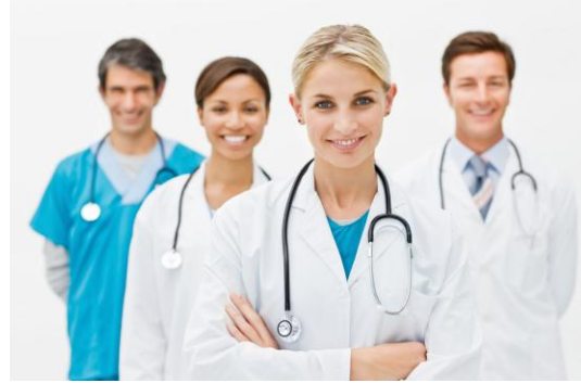
Cornerstone Medical Recruiting

The new high performance rural health care system will be anchored in primary care that integrates medical care, human services, and other services necessary for rural quality of life. Current policies designed to strengthen rural primary care (e.g., Rural Health Clinic payments, health professional shortage areas bonuses, and training programs designed to encourage locating practices in rural places) should be continued and evaluated.