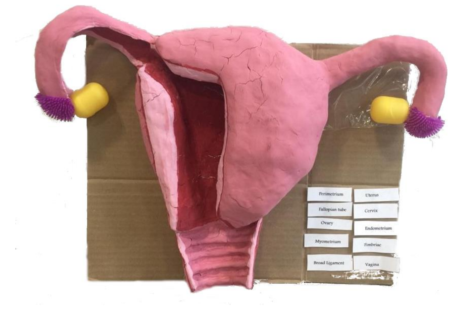
Figure 1. A selection of the anatomical models constructed by paramedic students.