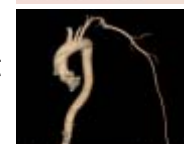
Figure 2. CT angiogram reconstruction of chest. An aneurysm of the left subclavian artery is seen. The arrow indicates left subclavian artery compression with first rib thoracic outlet syndrome.

The patient was offered surgery to resect his left first rib and repair the subclavian aneurysm but he refused initially and wanted to think about it. He was discharged on postoperative day 1. He was discharged on antiplatelet therapy with aspirin and not started on anticoagulation because the source of the thrombus was found to be the left subclavian aneurysm, which needed to be addressed surgically. The patient presented back on postoperative day 5 with recurrent numbness and coolness over his left hand. Ultrasound duplex revealed recurrent left distal brachial artery embolus. The patient agreed to proceed with embolectomy but did not agree to left first rib resection and subclavian aneurysm repair. Left brachial, radial, and ulnar embolectomy was performed through the existing left forearm antecubital fossa incision. Patient had an uneventful postoperative course and subsequently agreed to proceed with a definite repair for his thoracic outlet syndrome and left subclavian aneurysm.