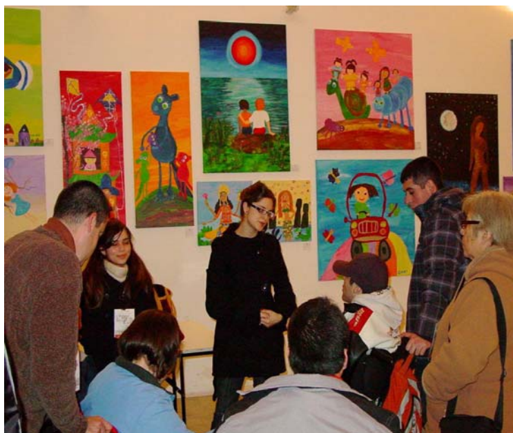
Fig 11 Exhibition of paintings by children from Teletón.