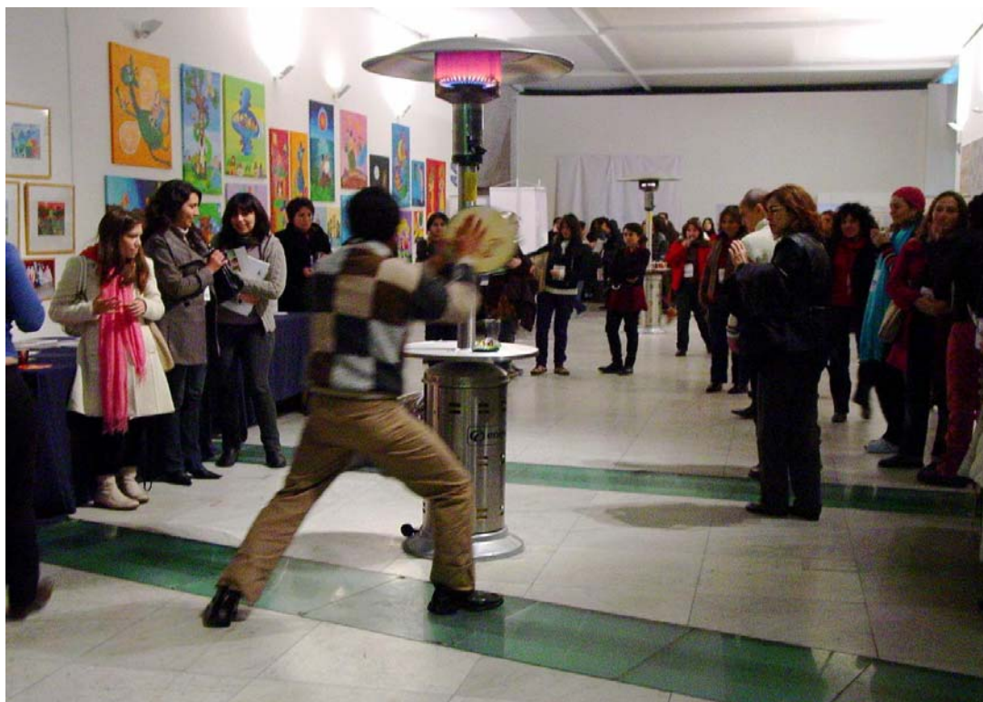
Fig 14 Performances