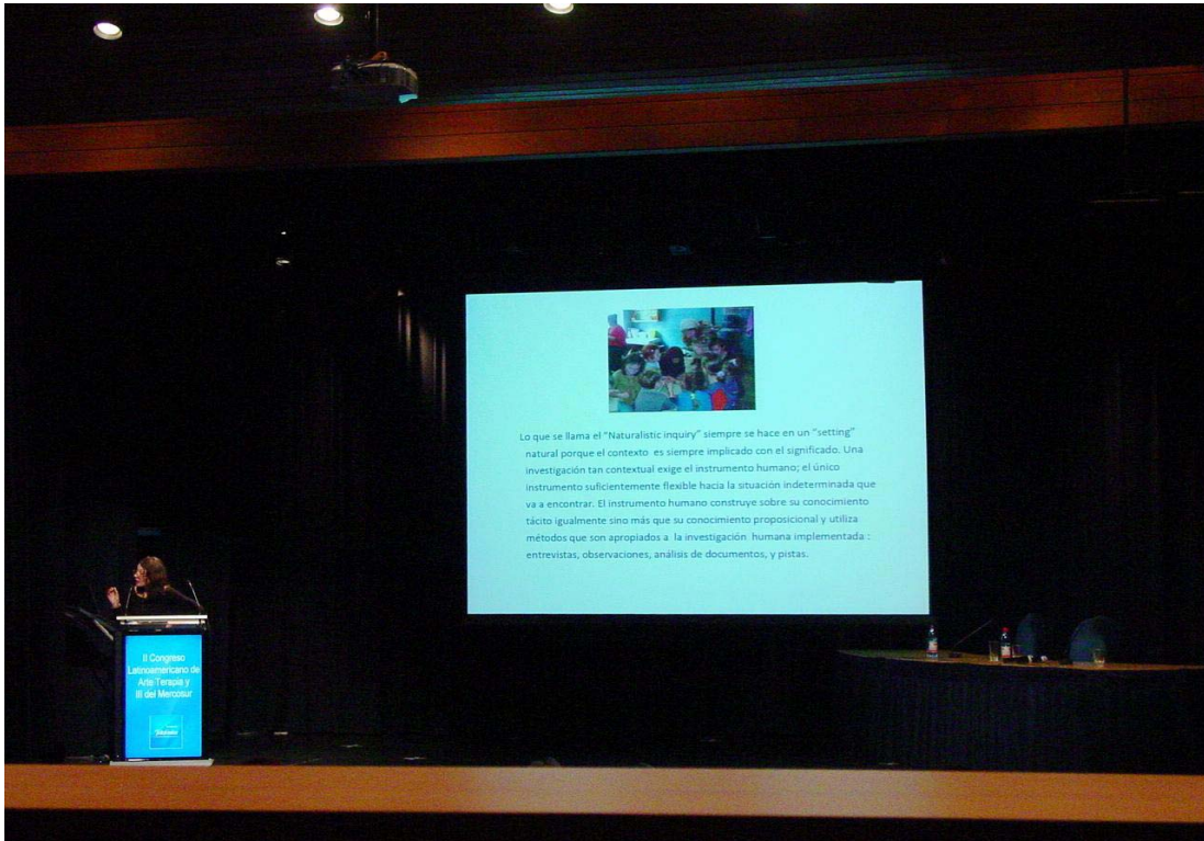
Fig 8 Margaret Hills, Scotland, United Kingdom.

In the course of the congress several experiential workshops took place covering specialized subjects that allowed for the implementation of different intervention models and techniques in art therapy practice (Fig 9).