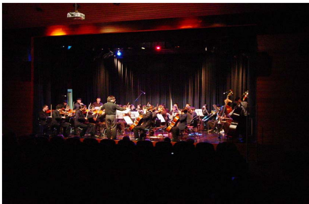
Fig 15 Talagante Youth Orchestra