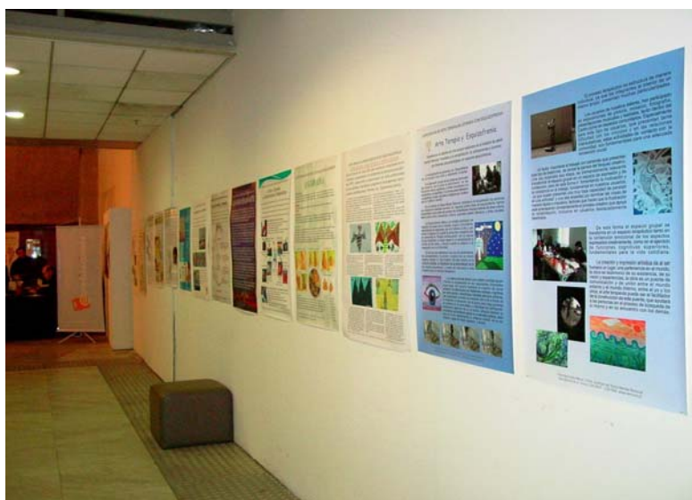
Fig 10 Poster Exhibitions

Themes from the Second Congress of Latin American Art Therapy were followed up in the central hall, which featured the display of posters selected from various Art Therapists, publicizing their experiences and different fields of intervention (Fig 10). In this same space converged exhibitions of paintings made by children from Telethon, Coanil, Red Cell, Crie and others, representing the work of different foundations dedicated to the rehabilitation of children and youth with special needs (Figs 11, 12). Along with this, the children's theatre company "Los Laureles" of Coanil, presented the play "The Locomotive", a presentation made especially for the Congress (Fig 13). Various performances took place, some spontaneously made by conference participants (Fig 14). There were also bookstalls selling sales of specialized books about the themes of the Congress.