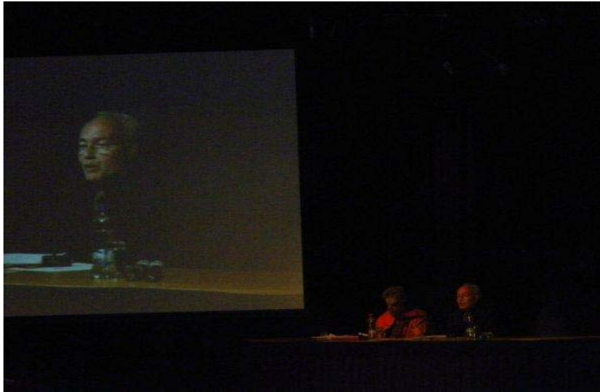
Fig 2 Professor Fiorini

The panel of the day reflected together on the challenges faced by Art Therapy in the context of health care in Chile and Latin America. The importance of research in Art Therapy at the national level was emphasised and it was acknowledged that the development of art therapy theory and practice through research needed to be integrated with the local realities of the different Latin American countries.