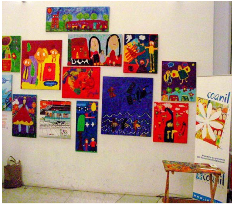
Fig 12 Exhibition of paintings by children from Coail.

The congress was a living environment for exchange, discussion and mutual enrichment. This was highlighted by the closing ceremony marked by the spontaneity of dance and music along with the Youth Orchestra of Talagante and the Transhuman Spontaneous Theatre Company, who fostered an atmosphere of joy and creativity together (Figs 15 – 21).