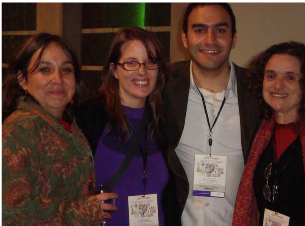
Fig 21 Organizing Committee