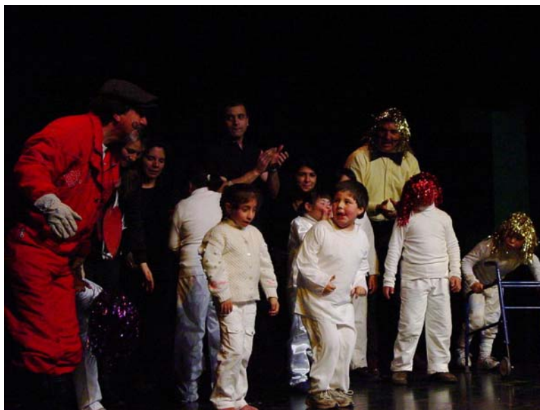
Fig 13 Children's Theatre company "Los Laureles" de Coail performing "La Locomotora"

The congress was a living environment for exchange, discussion and mutual enrichment. This was highlighted by the closing ceremony marked by the spontaneity of dance and music along with the Youth Orchestra of Talagante and the Transhuman Spontaneous Theatre Company, who fostered an atmosphere of joy and creativity together (Figs 15 – 21).