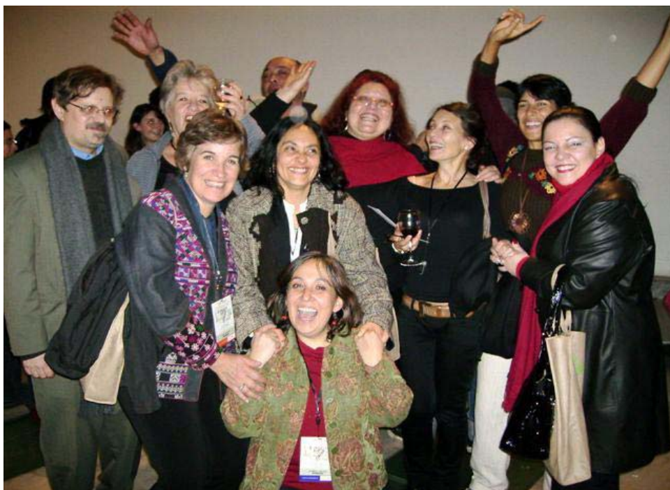
Fig 19 International guests at the II Congress Latin American Congress of Art Therapy.