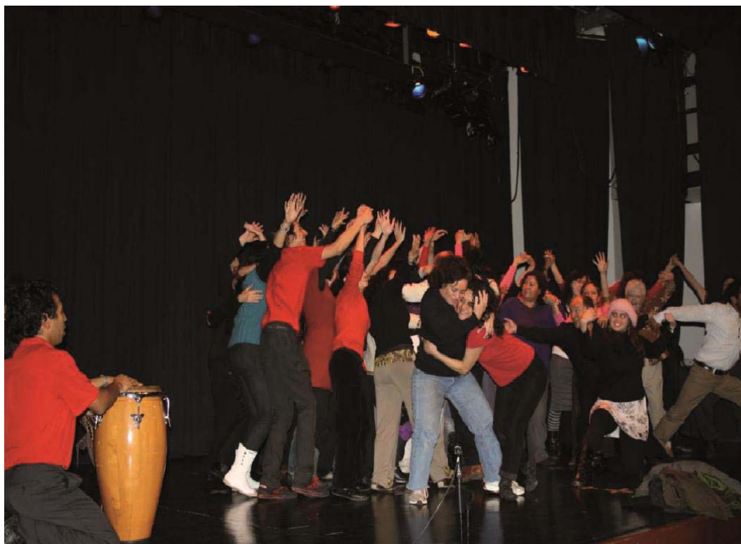
Fig 16b Spontaneous Transhuman Theatre Company and audience.