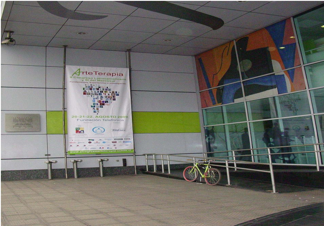
Fig 1 Conference Entrance

The II Latin American Congress on Art Therapy and III of Mercosur in Santiago, Chile was held on the 20, 21 and 22 August 2009 and was supported by the Foundation Telefónica.