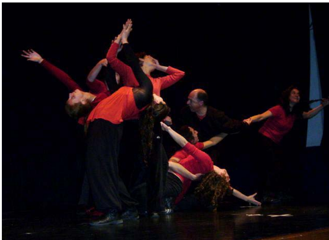
Fig 16a Spontaneous Transhuman Theatre Company and audience.