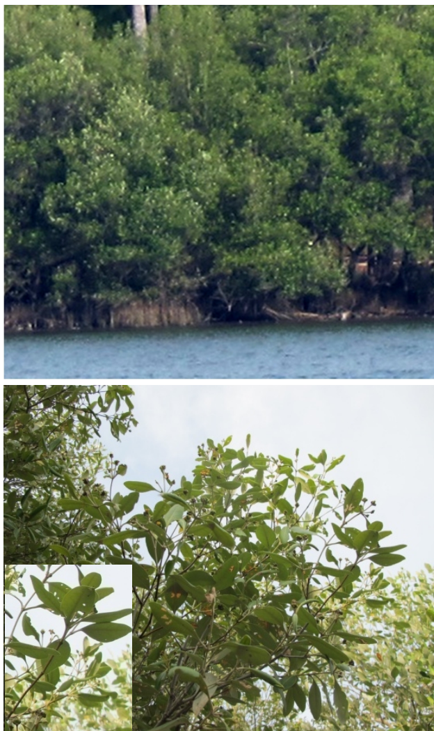
Figure 2. Coverage shape and characteristics of mangrove a. Avicennia marina with close coverage along the lake shore b. Oval leaf tip shape with white lower leaf surface is the diagnostic character of A. marina .

The calculation of Importance value Index (IVI) showed that the most important species was A. marina . This species was discovered almost in all ecosystem area around the salt water lake. This was supported by the calculated diversity index of Shannon-Wiener which showed the low diversity of mangrove vegetation in the ecosystem. In other words, the ecosystem is dominated by A. marina .