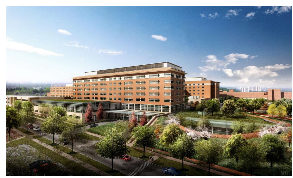
Figure 1: Reading Health System, Reading, PA

Through this study, we aim to identify the subset of the chronic migraine population that is utilizing the ED for headache treatment as seen in Figure 1. We focused on features of this population that will guide the selection of future strategies to meet the specific needs of the chronic migraineur of our health system. The chronic migraineur is likely a subset of the migraine population that represents the high-resource utilizers in our health system.