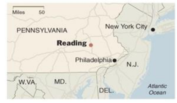
Figure 1: Reading, Pennsylvania located about 60 miles west of Philadelphia, Pennsylvania<sup>9</sup>.

Study took place in the ED of Reading Hospital in Reading, PA