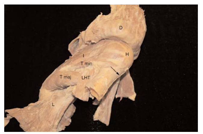
Figure 3. Photograph of completed prosection, posterolateral view, showing the bisected humerus ( black arrow ), put back together for continued study of the rotator cuff muscles. D : deltoid muscle; H : head of the humerus; I : infraspinatus muscle; L : latissimus dorsi muscle; LHT : long head of the triceps brachii muscle; T maj : teres major muscle; T min : teres minor muscle. [Color figure can be viewed in the online issue, which is available at www.anatomy.org.tr]

The primary purpose of developing this dissection protocol was to be able to successfully examine the elements of the glenohumeral joint capsule while ensuring the preservation of the attachments of the rotator cuff muscles. Although the dissection approach presented here differs from more traditional approaches to dissecting the glenohumeral joint, it can be done by students with typical anatomy laboratory equipment. This technique could be used to improve student under-standing of structures of the internal joint capsule and their relationship to the function of the glenohumeral joint in clinical classes. This unique dissection could also be used to fur-