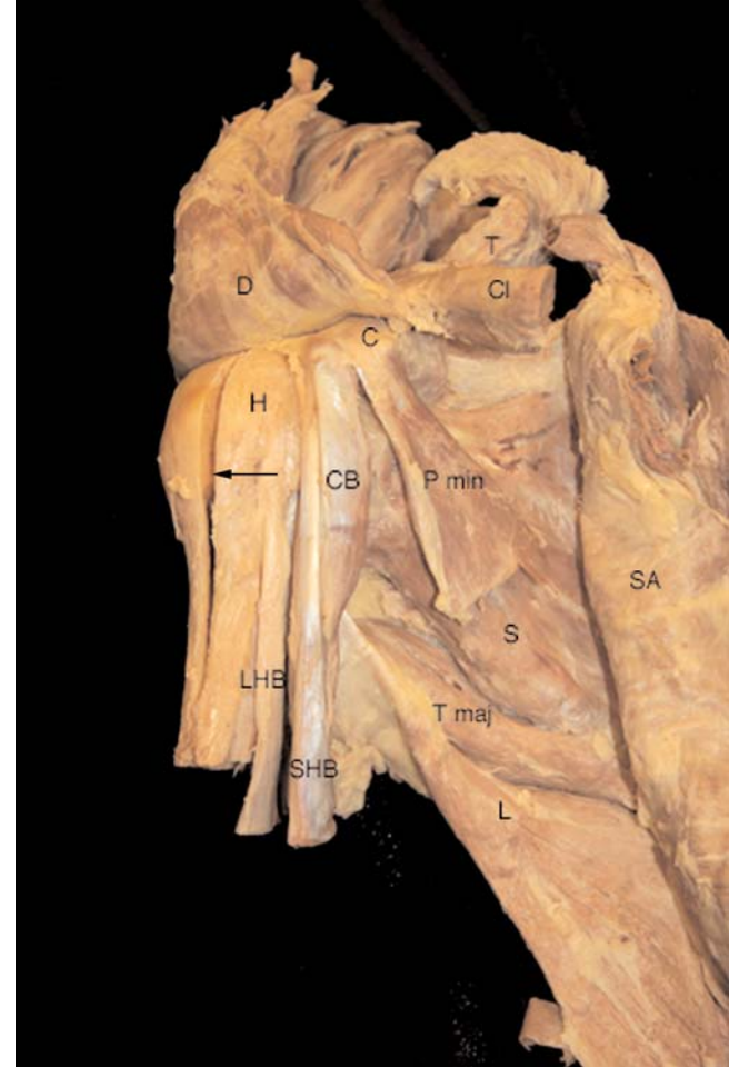
Figure 4. Photograph of the completed prosection, anterior view, showing the bisected humerus ( black arrow ), put back together for continued study of the muscles of the rotator cuff and pectoral girdle. C: coracoid process; CB: coracobrachialis muscle; D: deltoid muscle; H: head of the humerus; L: lattissimus dorsi muscle; LHB: long head of the biceps brachii muscle; P min: pectoralis minor muscle; S: subscapularis muscle; SA: serratus anterior muscle; SHB: short head of the biceps brachii muscle; T: trapezius muscle; T maj: teres major muscle. [Color figure can be viewed in the online issue, which is available at www.anatomy.org.tr]

The authors wish to thank the individuals who donate their bodies and tissues for the advancement of education and research.