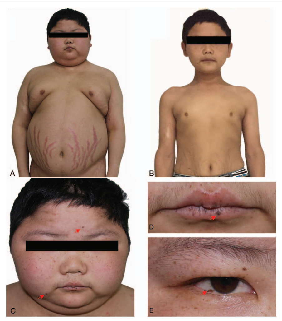
Figure 1. Patient characteristics before and after adrenalectomies. (A) Cushingoid features include moon face, central obesity, and purple striae of the bilateral axillary and lower abdomen before the operations. (B) Cushingoid features are decreased after left and right adrenalectomies. (C–E) Spotty skin pigmentation (indicated by red arrows) on the face (C), lip (D), and sclera (E).