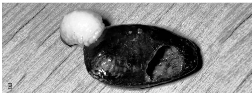
Figure 1. Optatus palmaris Pascoe 1889 on cherimoya fruits, A) Adult, B) Adult damaging fruit, C) Clusters of adults on fruit pedicel, D) Larvae feeding on fruit, E) Larvae damaging seed.