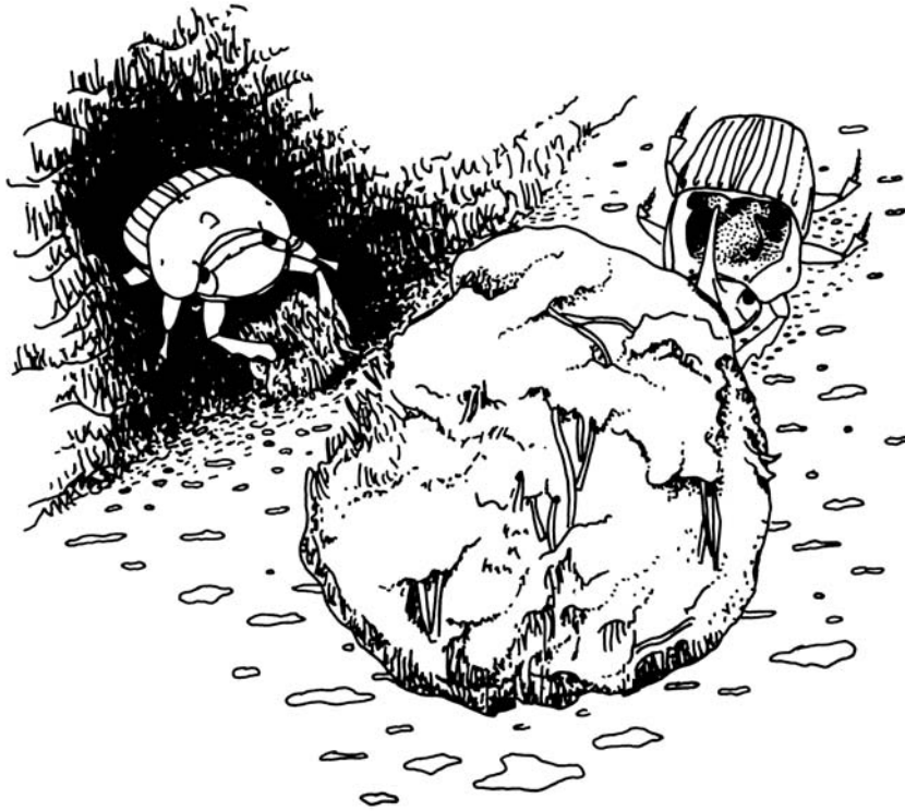
Figure 1. Phanaeus daphnis Harold. Cooperation between male and female. Male separates a small amount of dung that the female introduces in the burrow. (Picture redrawn from Halffter et al. 1974).

Food preference and detection. Dung beetles, including Phanaeus , generally feed as adults on the same food they provide for their larvae, and because male and female adults commonly share the same resource, feeding and reproductive behavior are not fully separable. Although our initial focus is on adult feeding, the early phases of both processes are generally identical and often simultaneous. Adaptive modifications for coprophagy among the Scarabaeinae have been examined by Halffter & Matthews (1966).