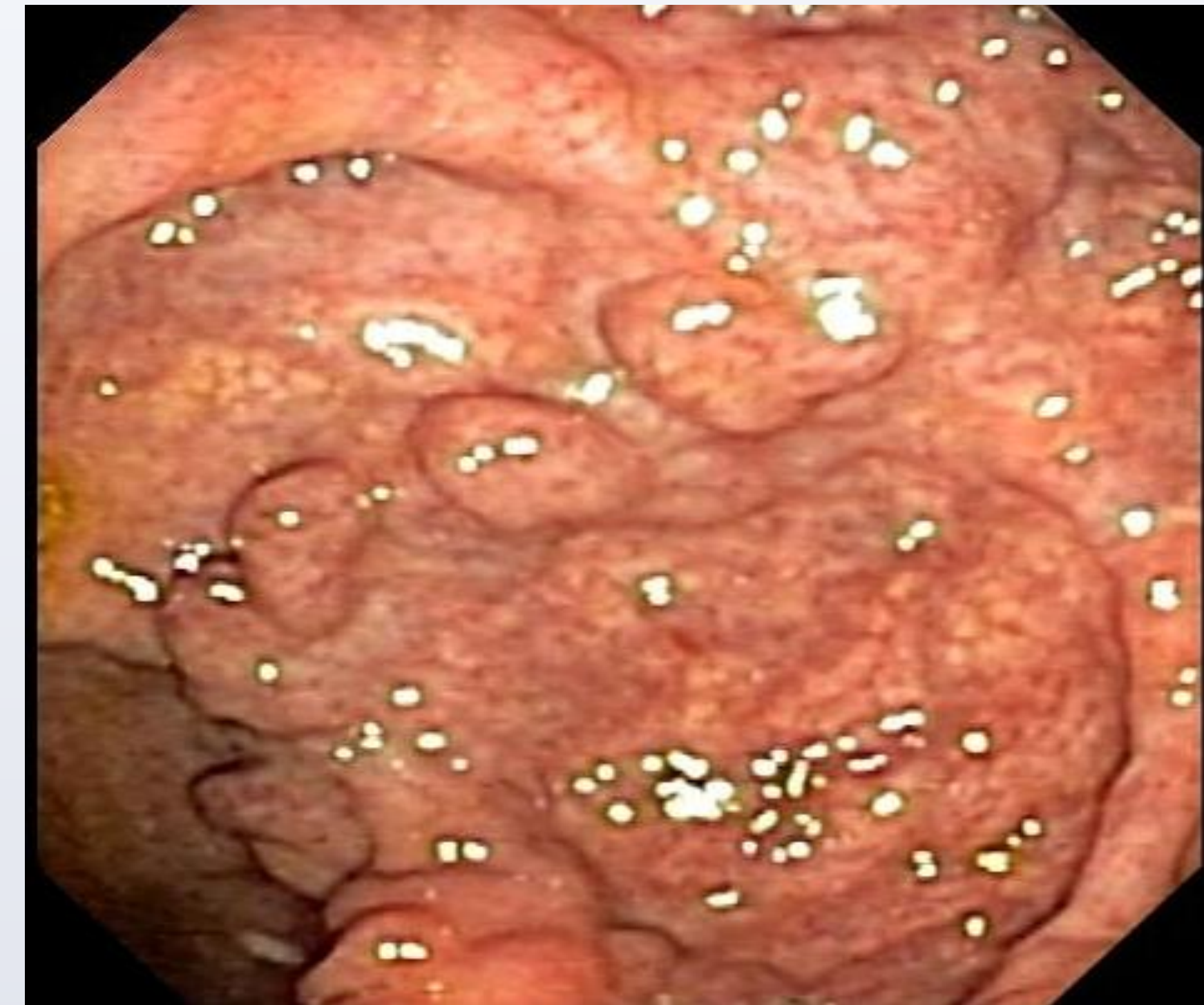
Figure B: Colonic Varices at Colonoscopy