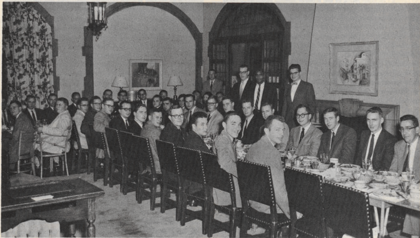
A meeting of the National Honor Scholars who are members of the entering class. The undergraduate colleges represented are the University of Alabama, Albion, Antioch, Bates, Beloit, Bowdoin, Brigham Young, Carleton, Colgate, Cornell College, Davidson, DePauw, Emery, Pepperdine, Grinnell, Hamilton, Harvard, Haverford, University of Kansas, Maine, Maryville, Millikin, Nebraska, North Carolina, Reed, Ripon, St. Olaf, Syracuse, Southern Methodist, Tufts, Whitman, Wittenberg, Yale.