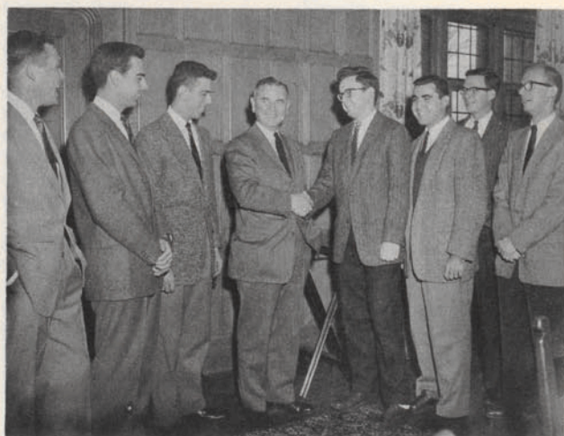
Mr. Justice Brennan, newly appointed to the Supreme Court of the United States, lunched recently with residents of Mead House, the Law School Residence. He is shown being greeted by students upon his arrival.