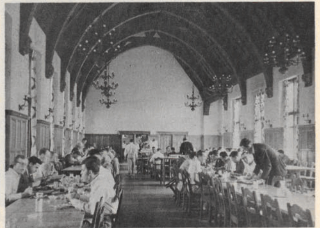
Judson Dining Hall in Burton-Judson Courts, where residents of Mead House, the new Law School Residence, now take their meals.