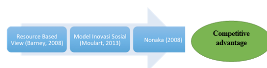
Figure 1. Research Framework (2016)

Learning model from Nonaka knowledge creation model is generally applied in the corporate context with more structural innovation learning. State of the art of this research is that how the model applied in the different context. According to Kusumastuti, creation of new knowledge at micro, small and medium scale business scale also occurs at contextual level (Kusumastuti, et.al 2015). To explore how traditionally songket cloth can have Competitive Advantage, the resource based view perspective (Barney and Hesterly, 2010) is used to explore the primary source of Competitive Advantage namely People and Culture. State of the art in this study is the theoretical adalah innovation which combine the perspective of Moulaert, et.al (2013) and Nonaka, et.al (2008), and practical side of research team focus on traditional cloth with indigenous characteristics with high local wisdom in the learning process of innovation.