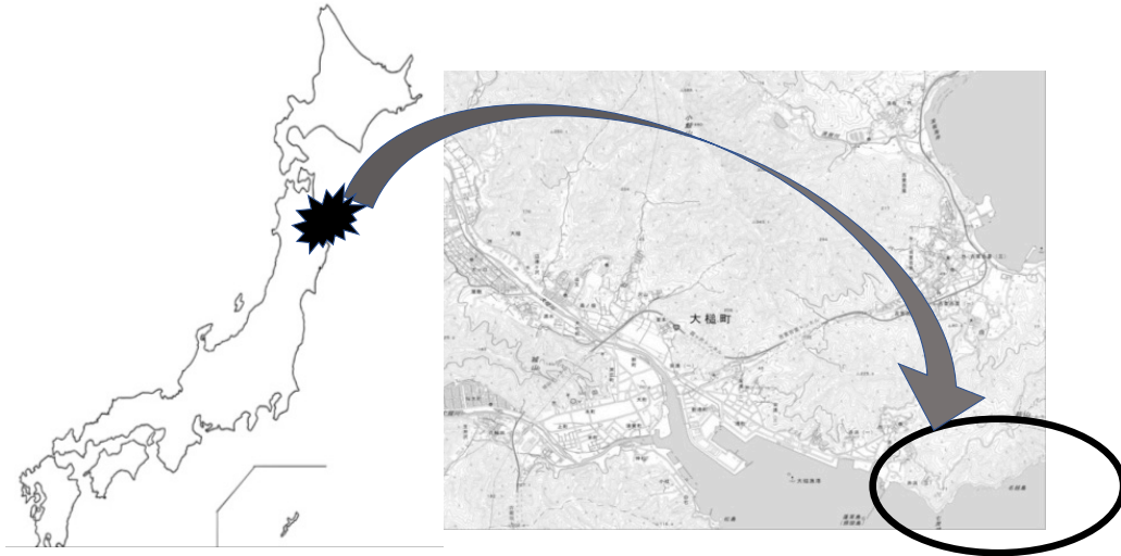
Figure 1. Position of the AK district in Otsuchi-Town, Iwate Prefecture