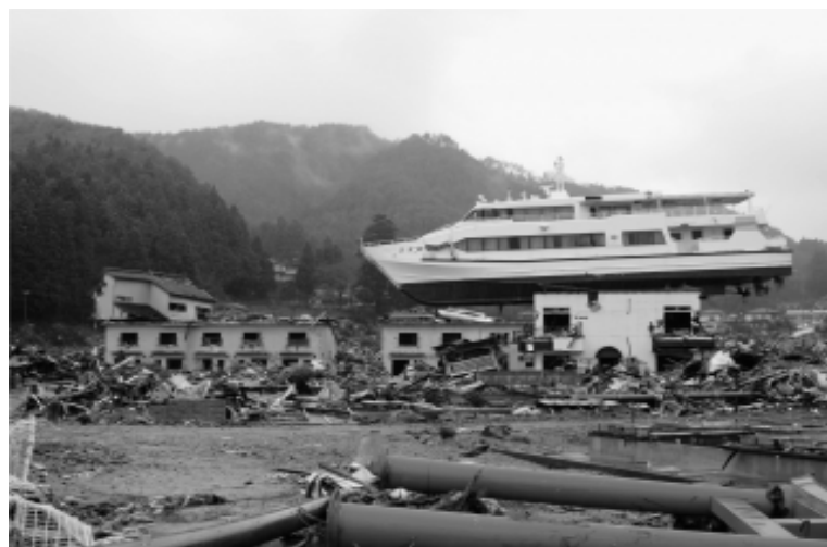
Figure 2. Sightseeing ship washed ashore on a guesthouse by the tsunami

The AK district is located on the edge of the Gulf of the Rias coastline, where two large rivers flow in from the mountain. The town has developed thanks to its rich fishing grounds. The AK district is geographically isolated, but there has been continuous interaction with people outside by the sea. The characteristic of the deep gulf in AK district catered to develop shipyards and dockyards in the region and that facilitated frequent exchanges with local and out-of-town fishermen. The modernization of fishing ports started from 1947 enabled deep-sea fishing in the area and it remained popular until the 1980s. However, the oil shock, which delivered a worldwide blow in the 1970s, and the establishment of the 200 nautical mile system forced the