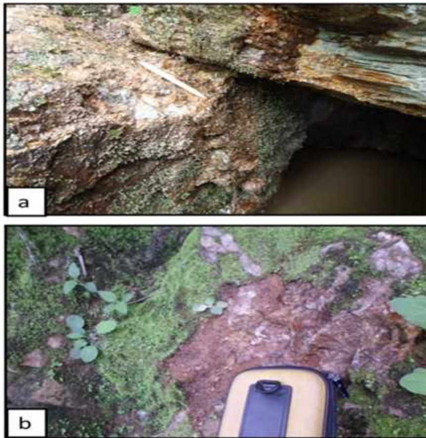
Fig. 3a. Pyrite and other sulfide occurrence as an indication of mineralization; 3b. Typical quartz vein within albite-pyrite-quartz-carbonate rocks in Awak Mas.

disrupt or offset mineralization. A surface layer of consolidated scree and colluvium averaging 3 m to 4 m (maximum 15 m) in thickness veneers the deposit. The base of weak oxidation within the mineralized sequence typically is within 20 m of surface.