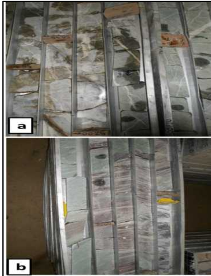
Fig. 4a. Shallow-dipping zones of sheeted and stockwork quartz veining; 4b. Steeper dipping zones of quartz veining and breccias associated with high-angle faults