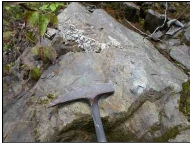
Fig. 5. Barren quartz vein in mudstone