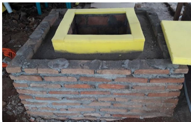
Figure 1. ZECC was placed on the surface