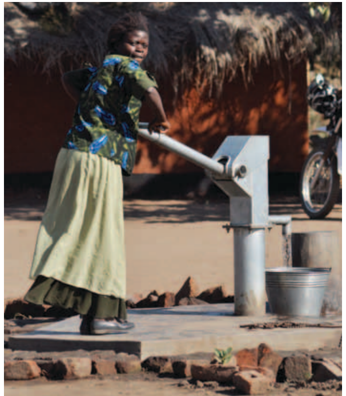
Drawing water from a new well in Malawi.