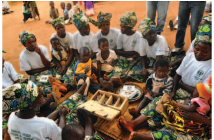
A savings and loans group in Malawi.

In preparing students to engage professionally in the quest for social justice, the IPDS program has become a proud part of Avondale’s culture of service and altruism.