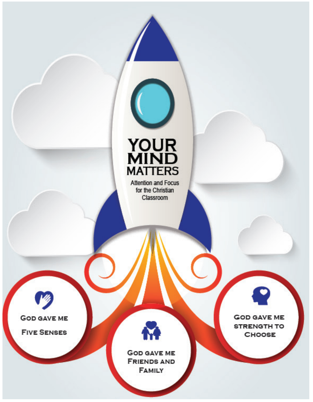
Figure 1: Visual poster created by author for classroom use