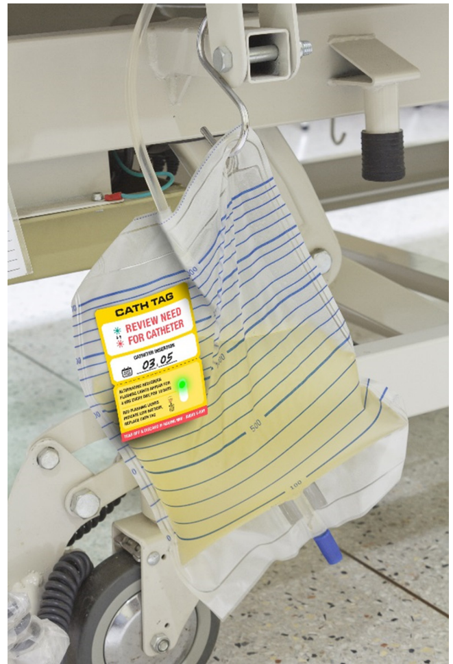
Figure 2 The CATH TAG attached to a catheter bag.

Eligible wards in the hospital will be randomly assigned to cross over to the intervention every 4 weeks over the trial duration of 24 weeks. If no clustering, the sample size for 80% power at 0.05 significance would be 816. Allocation of wards to the intervention will be concealed. Computer-generated randomisation of the crossover dates for the wards will be performed independently by one of the investigators, who will not be involved in assessment or delivery of the intervention. All included wards will be provided with sufficient notice of the dates to cross over