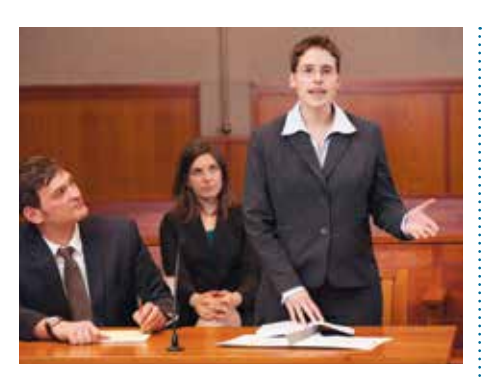
Maine Law students are accustomed to standing up for their clients in court.

The primary focus of the Juvenile Justice Clinic is the direct representation of juveniles with pending delinquency matters in state courts. Student attorneys appear in Juvenile Court each week with their clients for proceedings such as arraignments, detention hearings, plea negotiations and trials. In 2013 the Juvenile Justice Clinic provided full representation to approximately 57 children who were facing charges including Arson, Burglary of Motor Vehicle, Assault, Criminal Mischief, Possession of Alcohol, Possession of Dangerous Knives, and Unlawful Sexual Contact. On behalf of their juvenile clients, student attorneys work closely with social service agencies, legal aid providers, schools, and other community representatives. The goal is to develop and implement personalized, holistic and targeted programs for each juvenile client. Such programs are designed to keep the juveniles out of jail and prison, and to get them back on track to completing their education. The team also focuses on developing important life skills to ensure continued success. Accordingly, important components of an individualized plan may include treatment for underlying substance abuse or mental health problems, an appropriate educational program, suitable housing and other services for the client, and in many instances, his or her family.