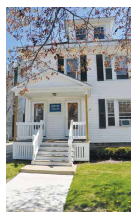
The Cumberland Legal Aid Clinic's home on Exeter Street in Portland.

At the same time, the Clinic has been a central part of fulfilling Maine Law's community service mission for more than 40 years. As described within these pages, our student attorneys assisted more than 600 individuals last year with a wide range of legal matters, and the students' work had an even more farreaching impact through our outreach, education, and advocacy projects. For example, we anticipate that hundreds of Maine asylum-seekers will benefit from the Pro Se Asylum Manual (described on page 9) that Clinic students researched,