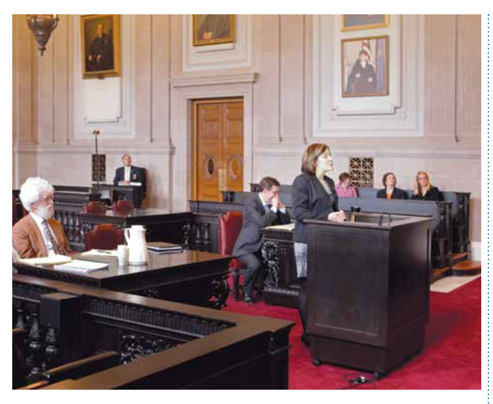
Students in the Cumberland Legal Aid Clinic sometimes have the opportunity to brief and argue cases before Maine's highest court.

"My student attorney was very kind and helpful. She listened to and answered all of my questions. She was a great attorney!"