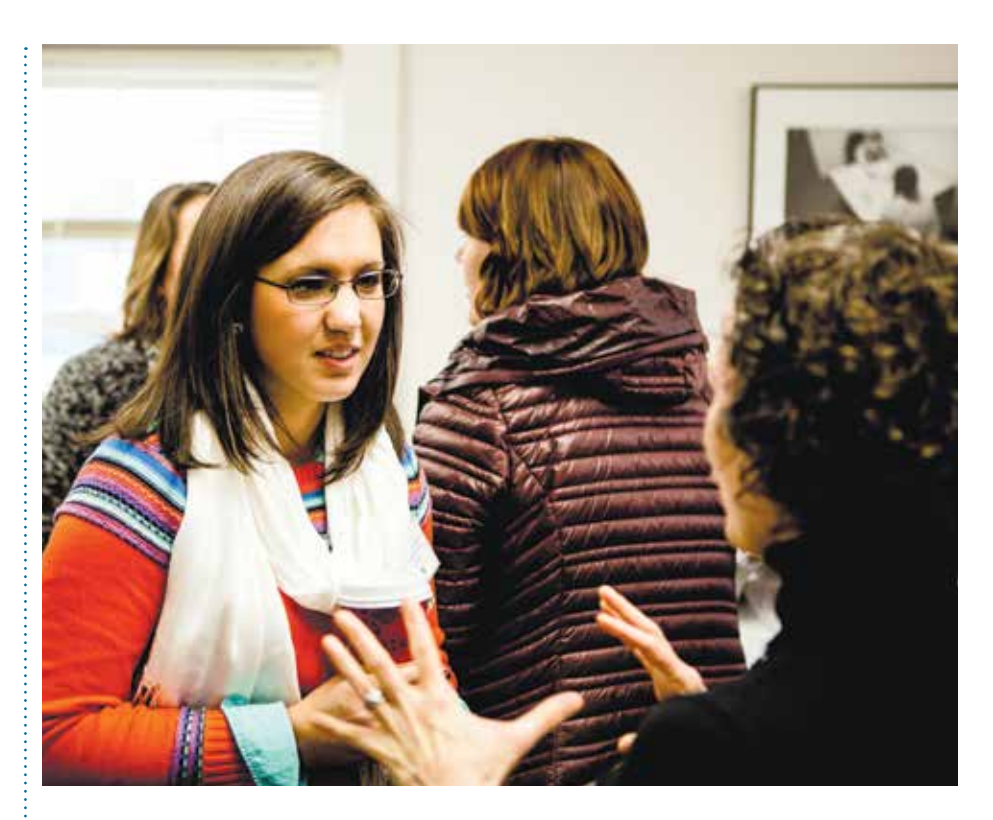
Each fall, the Cumberland Legal Aid Clinic holds an open house for first-year students to learn about the course offerings.

Students last year appeared as counsel in the following proceedings: 3 interim hearings; 65 Protection from Abuse trials; 186 Protection From Abuse agreements presented to the Court: 60 juvenile proceedings; 17 family law final hearings or trials; 2 Probate Court final hearings; 15 mediations; 4 judicial settlement conferences; 32 non-hearing proceedings before Family Law Magistrates; 14 arraignments; 5 change of pleas; 14 criminal dispositional conferences; 3 Law Court briefs; 1 Law Court oral argument; 2 bail hearings; 3 proffer meetings with the Office of the U.S. Attorney; 6 asylum hearings; 1 Adjustment Interview; 1 Immigration Court Master Calendar Hearing; and numerous other miscellaneous appearances.