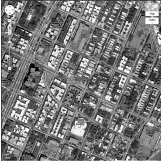
Photo 4. Aerial view of segment of Santa Rosa, California. 65