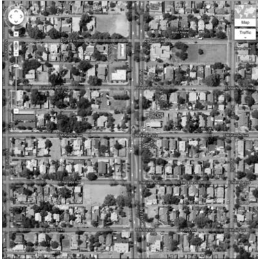
Photo 2. Aerial view of segment of Philadelphia, Pennsylvania. 63