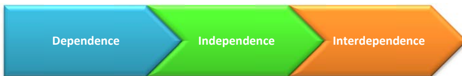
Figure 1. The Crawl-Walk-Run Continuum.

The teaching contract itself is a “learning partnership” where both students and instructor are actively involved in the process of creating knowledge. Portfolios provide an active link in this process that moves students along the Crawl – Walk – Run continuum as will be outlined below.