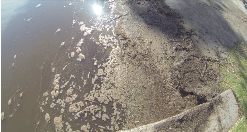
FIGURE 1. GoPro footage from eye-level of the photographer

One of the key reasons for conducting a post analysis of pre-visualization is that most people cannot practice their art form and give a verbal commentary at the same time. Thus footage will be used to trigger memories of the events where the students felt they were successful, where there was frustration, and where they believed they could have seen different images to those captured. The video data can also be replayed multiple times in the analysis of possible affective and cognitive decisions taken by the student. More significantly, these can be later overlaid with the post-visualization data to better inform the complexity of the decisions that need to be made in the construction of a photographic image.