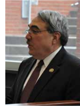
Congressman G. K. Butterfield '74

Assistant Attorney General, United States Department of Justice, Civil Rights Division, February 1, 2010. The Merits of Public Service in the Federal Government