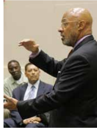
Hon. Dennis W. Archer

Dean Pepperdine School of Law, former U.S. Solicitor General, former Judge D.C. Court of Appeals, now President of Baylor University, October 22, 2008. The Modern American Lawyer and the Caring Community