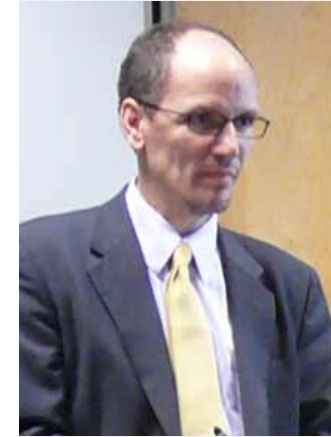
Thomas E. Perez

Assistant Attorney General, United States Department of Justice, Civil Rights Division, February 1, 2010. The Merits of Public Service in the Federal Government