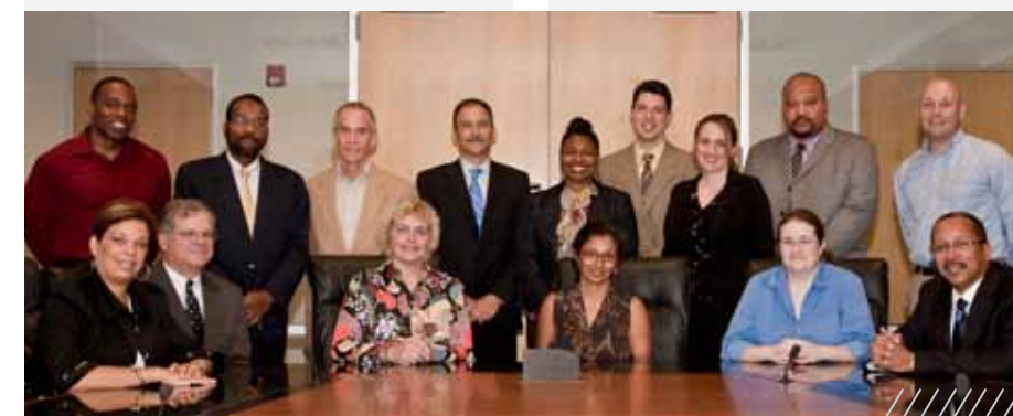
Adjunct Orientation Dinner in the Summer of 2010