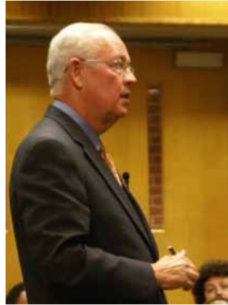
Hon. Kenneth W. Starr

Vice President and General Counsel, Administration and External Relations, Wal-Mart Corporation, September 16, 2008. Making Diversity Sustainable in the Legal Profession