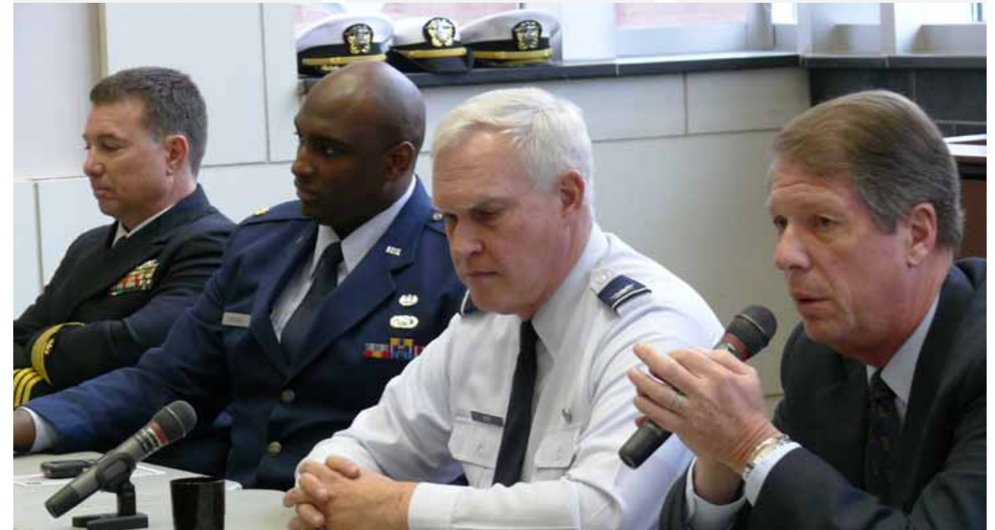
Issues in Law and National Security Forum

THE LAW SCHOOL PROUDLY HOSTS DISTINGUISHED SPEAKERS FROM ACROSS THE UNITED STATES REPRESENTING THE HIGHEST LEVELS OF THE JUDICIARY, PUBLIC AND MILITARY SERVICE, CORPORATIONS AND ACADEMIA.