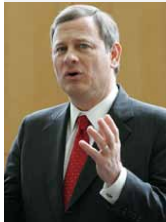
Hon. John G. Roberts, Jr.

Vice President and General Counsel, General Motors North America, September 22, 2008. Diversity as an Imperative in the Legal Profession