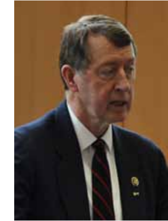
Congressman Bob R. Etheridge

February 5, 2010. Federal Tax Law Update