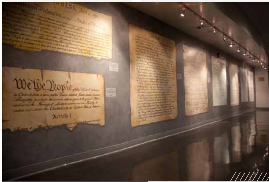
Mural of The Constitution of the United States of America