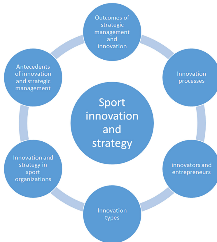
Figure 2. main article themes of the literature on sport innovation

In this part of the literature review, I move from describing the characteristics of the literature to analyzing the themes, topics and content of the reviewed literature on sport innovation. Reading the published articles on sport innovation, some central topics appeared to be reoccurring. From an inductive research approach (Tjora, 2010) some main themes were determined in the reviewed literature. These main themes of research on sport innovation and strategy were then divided into six different categories: 1) Outcomes of strategic management and innovation, 2) innovation processes, 3) innovators and entrepreneurs, 4) innovation types, 5) innovation and strategy in sport organization and 6) antecedents of innovation and strategic management. These central topics are here illustrated in Figure 2.