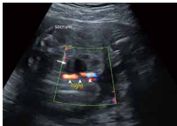
Figure 1 A sonographic image of the umbilical cord at 25 and 5/7 weeks of gestation. Right umbilical artery (arrowheads) is present around the urinary bladder (an arrow), whereas left umbilical artery is absent.

When she was at 24 weeks of gestation, SUA was noted on ultrasonography due to the absence of the left UA ( Figure 1 ). TORCH serology was negative except for elevated serum IgM and IgG antibodies against CMV with enzyme-linked immunosorbent assay; the titers of anti-CMV IgM and IgG antibodies were 1.49 (<0.8) and 15.5 (<2.0), respectively. Primary CMV infection or CMV reactivation of the mother during pregnancy was suspected. Ultrasound examination showed neither morphological abnormalities nor growth retardation of the fetus. On 28 weeks of gestation, the anti-CMV IgM antibody titer (1.68) was almost stable, and the DNA of CMV was not detected in the vaginal discharge. Thus, medical follow-up was performed, the fetus was small for gestational age at 35 and 38 weeks of gestation during the course observation.