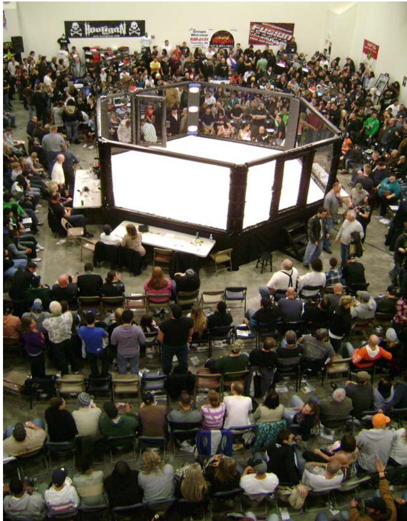
Figure 1. Cage fight crowd, November 7, 2009.

Perhaps the crowd handled themselves with such respect because they knew they had a stigma to overcome. There was an entirely different segment of the population on Faith's property that evening.