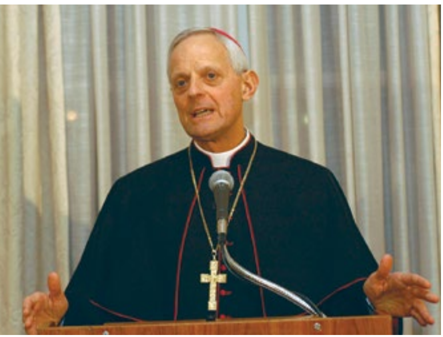
Donald Cardinal Wuerl